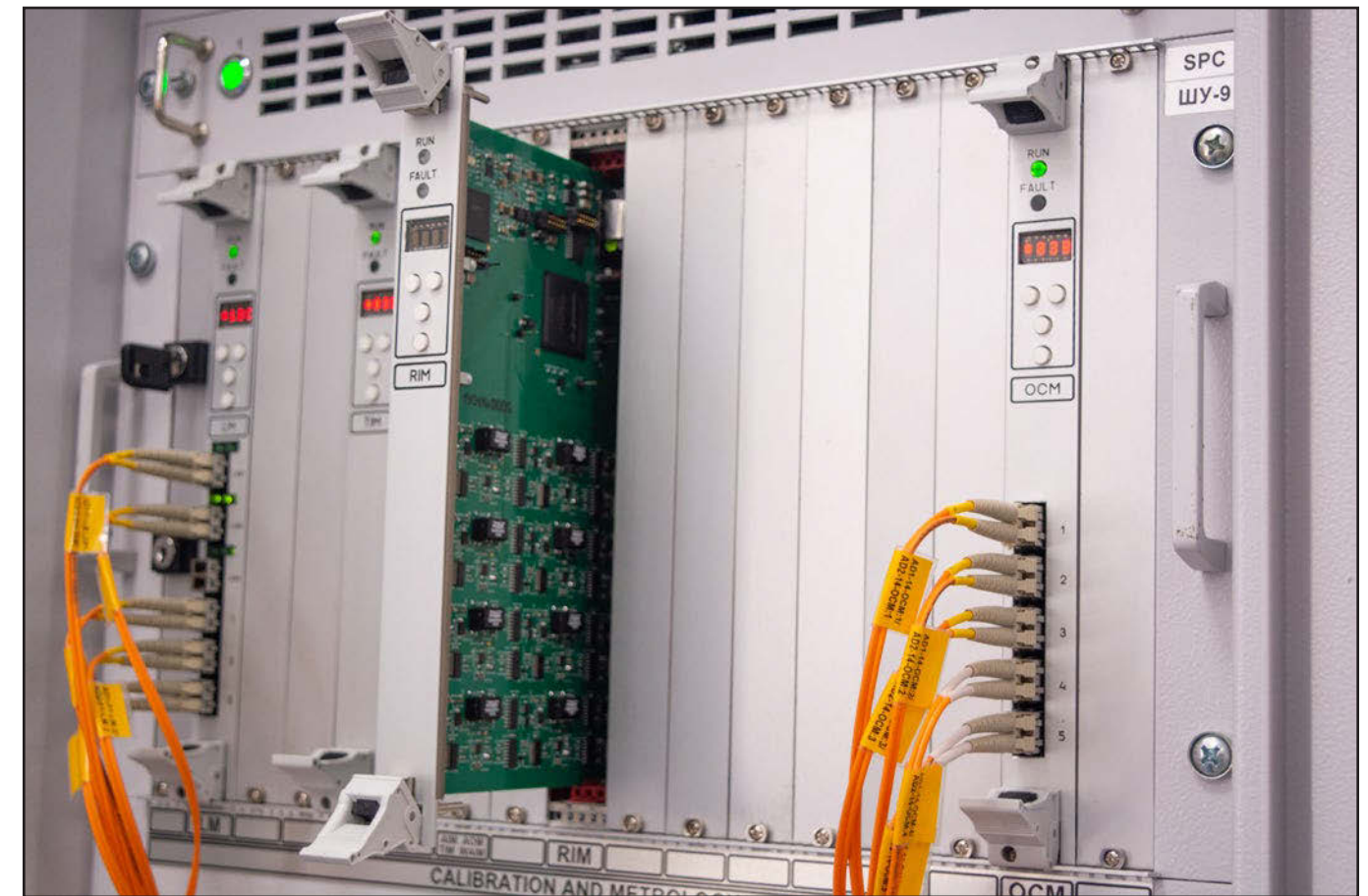
RadICS Platform chassis

The internal diversity features of the RadICS Platform augment the existing diversity features of the I&C system designs for the operating fleet. The key decisions to use FPGA and CPLD chip designs resulted in a number inherent diversity attributes for the RadICS Platform. The FPGA technology allows for more deterministic performance than a microprocessor due to capability of executing logic functions and control algorithms in a parallel mode due to the hardware parallelism inherent to FPGA technology. This parallelism also provides the ability to segregate safety functions and self-test and diagnostics functions. The resulting circuits are